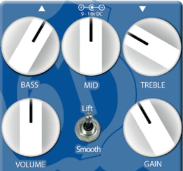
A thousand songs have been built on this tone... with good reason!

WAMPLER Pedals Limited Warranty. WAMPLER offers a five (5) year warranty to the original purchaser that this WAMPLER product will be free from defects in material and workmanship. A dated sales receipt will establish coverage under this warranty. This warranty does not cover service or parts to repair damage caused by accident, neglect, normal cosmetic wear, disaster, misuse, abuse, negligence, inadequate packing or shipping procedures and service, repair or modifications to the product, which have not been authorized by WAMPLER. If this product is defective in materials or workmanship as warranted above, your sole remedy shall be repair replacement as provided below. RETURN PROCEDURES. In the unlikely event that a defect should occur, follow the procedure outlined below. Defective products must be shipped, together with a dated sales receipt, freight pre-paid and insured directly to WAMPLER SERVICE DEPT – 3383 Gage Ave., Huntington Park, CA 90255, USA . A Return Authorization Number must be obtained from our Customer Service Department prior to shipping the product. Products must be shipped in their original packaging or its equivalent; in any case, the risk of loss or damage in transit is to be borne by the purchaser. The Returns Authorization Number must appear in large print directly below the shipping address. Always include a brief description of the defect, along with your correct return address and telephone number.