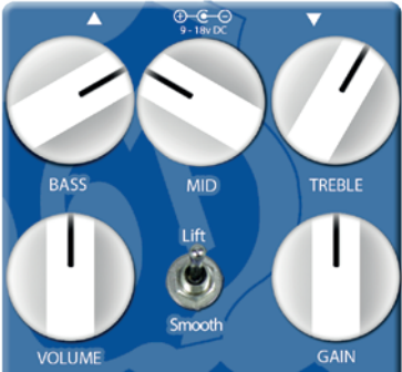
Enough to make the sky cry.