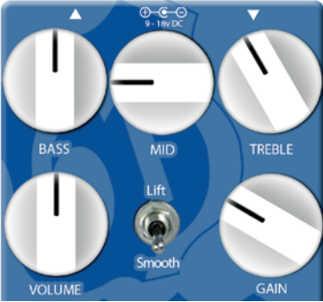
Slightly pushing, a rounded tone that is subtle yet powerful.