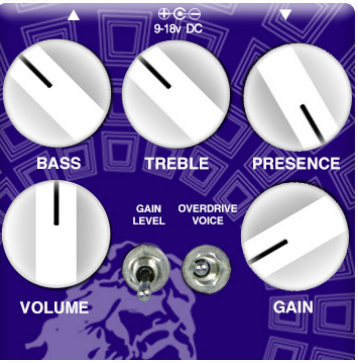
Treble Booster... time to cut through that mix!

WAMPLER Pedals Limited Warranty. WAMPLER offers a five (5) year warranty to the original purchaser that this WAMPLER product will be free from defects in material and workmanship. A dated sales receipt will establish coverage under this warranty. This warranty does not cover service or parts to repair damage caused by accident, neglect, normal cosmetic wear, disaster, misuse, abuse, negligence, inadequate packing or shipping procedures and service, repair or modifications to the product, which have not been authorized by WAMPLER. If this product is defective in materials or workmanship as warranted above, your sole remedy shall be repair replacement as provided below. RETURN PROCEDURES. In the unlikely event that a defect should occur, follow the procedure outlined below. Defective products must be shipped, together with a dated sales receipt, freight pre-paid and insured directly to WAMPLER SERVICE DEPT – 3383 Gage Ave., Huntington Park, CA 90255, USA . A Return Authorization Number must be obtained from our Customer Service Department prior to shipping the product. Products must be shipped in their original packaging or its equivalent; in any case, the risk of loss or damage in transit is to be borne by the purchaser. The Returns Authorization Number must appear in large print directly below the shipping address. Always include a brief description of the defect, along with your correct return address and telephone number.