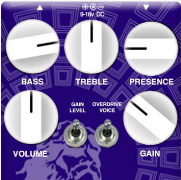
Classic, vintage rock... can fit in ANY rock song of today