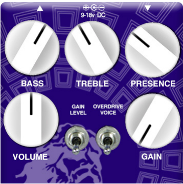
Clean and clear booster - Taking you over the edge