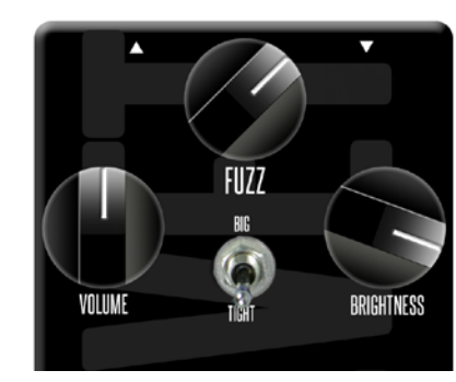
Numb, but comfortable