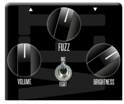
Cliffs of Johnson