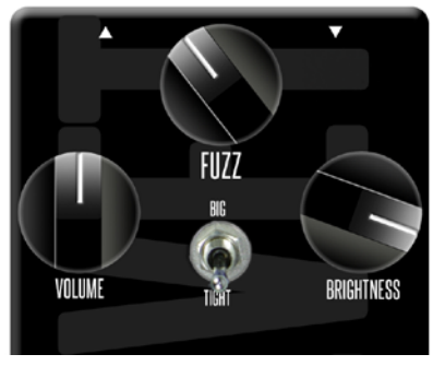
White, and stripey

WAMPLER Pedals Limited Warranty. WAMPLER offers a five (5) year warranty to the original purchaser that this WAMPLER product will be free from defects in material and workmanship. A dated sales receipt will establish coverage under this warranty. This warranty does not cover service or parts to repair damage caused by accident, neglect, normal cosmetic wear, disaster, misuse, abuse, negligence, inadequate packing or shipping procedures and service, repair or modifications to the product, which have not been authorized by WAMPLER. If this product is defective in materials or workmanship as warranted above, your sole remedy shall be repair replacement as provided below. RETURN PROCEDURES. In the unlikely event that a defect should occur, follow the procedure outlined below. Defective products must be shipped, together with a dated sales receipt, freight pre-paid and insured directly to WAMPLER SERVICE DEPT – 3383 Gage Ave., Huntington Park, CA 90255, USA. A Return Authorization Number must be obtained from our Customer Service Department prior to shipping the products must be shipped in their original packaging or its equivalent; in any case, the risk of loss or damage in transit is to be borne by the purchaser. The Returns Authorization Number must appear in large print directly below the shipping address. Always include a brief description of the defect, along with your correct return address and telephone number.