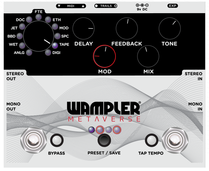
ALT controls depicted in red